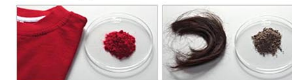
▲ Lapping analysis of fiber sample with KBr particles