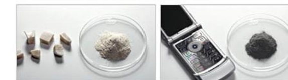
▲ Before and after bone grinding with LAWSON grinding apparatus

The excellent grinding effect of LAWSON grinding instrument